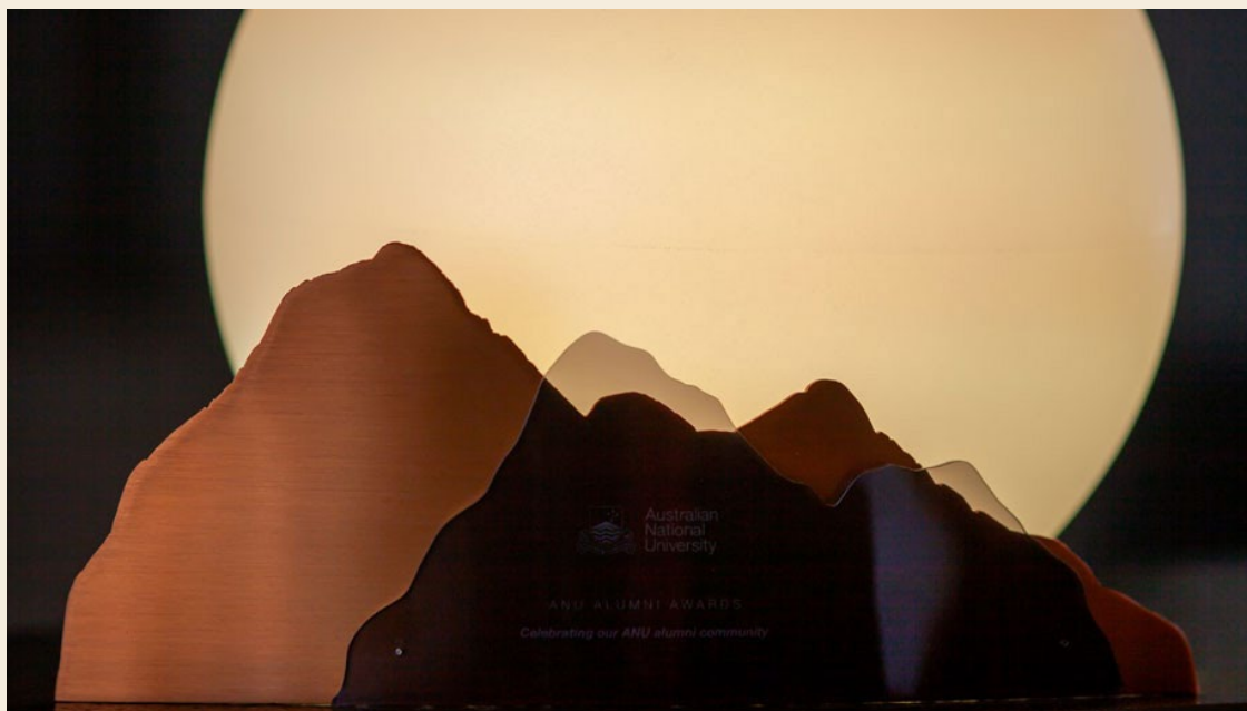
ANU Alumni awards – nominations are open .