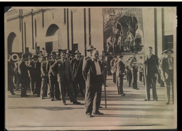
vi219vinU lbn0128M n6ll572uA

Maritime Union of Australia » May Day, Brisbane Waterside Workers' Federation of Australia » May Day Procession