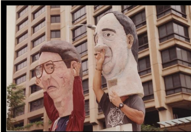
Australian National University

Students hold a sit-in on Alinga St in one of the first student protests against the Vietnam War. 15 Students are arrested and fined.