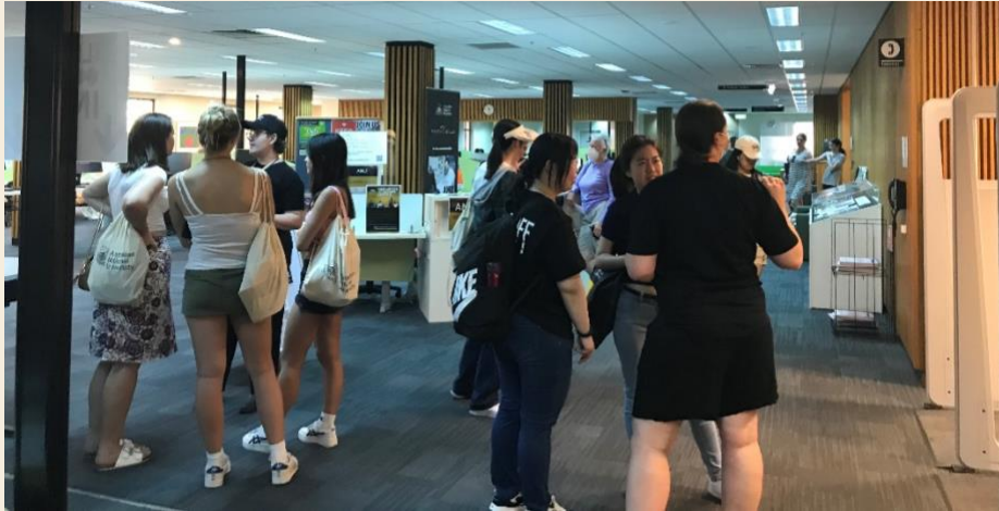
Fabulous work by SIS staff on ANU Open Day!