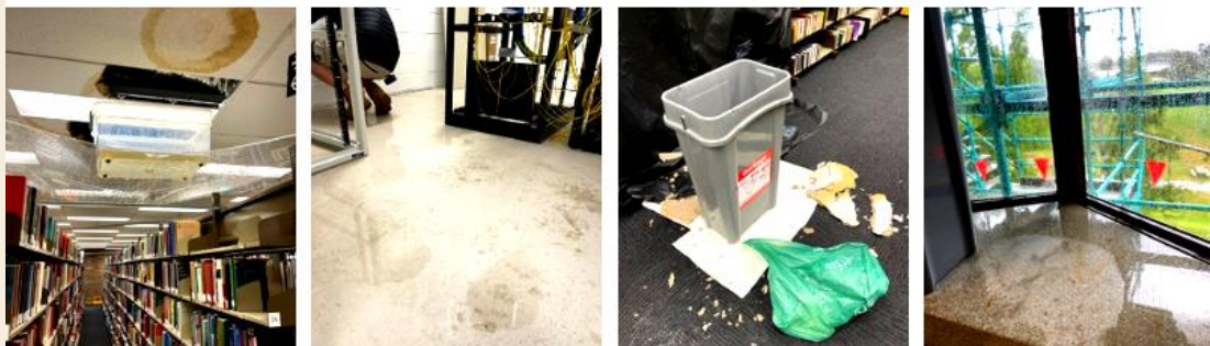
Welcome to 2023