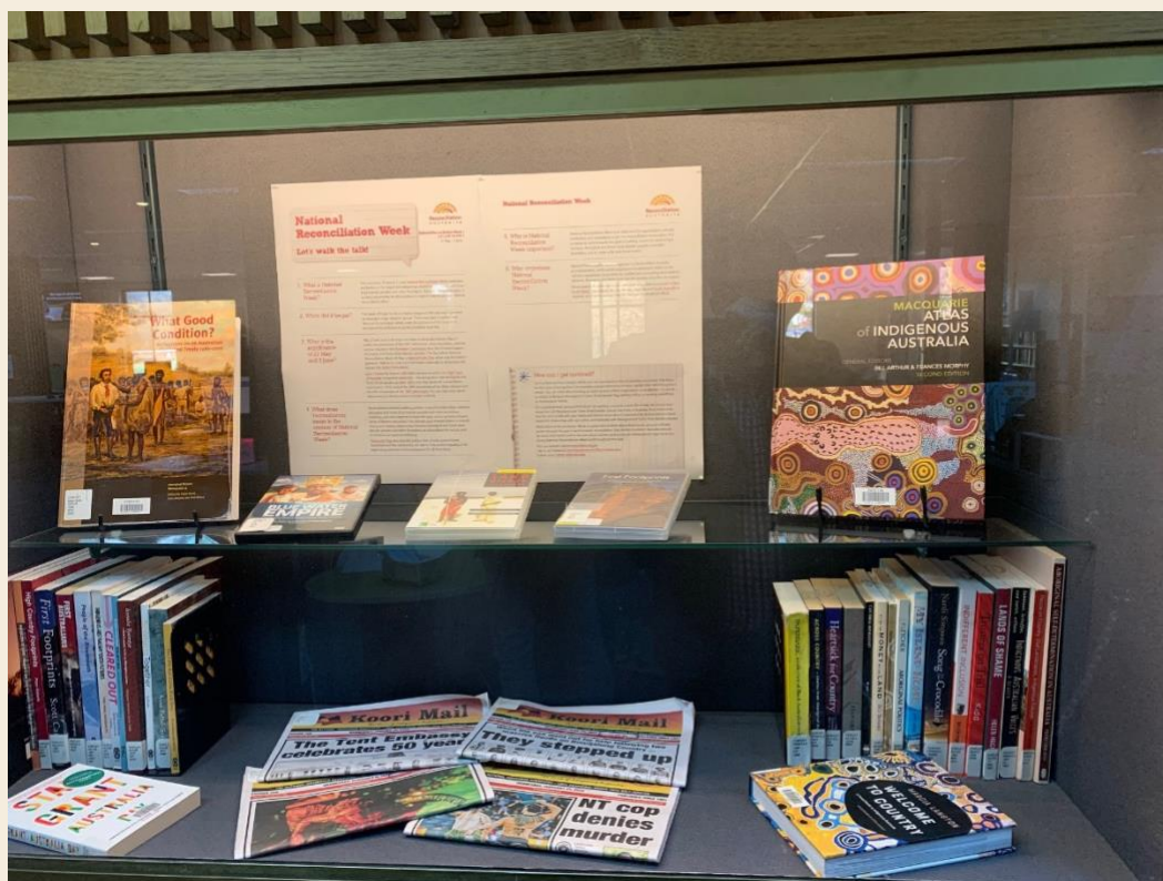
JB Chifley Library display for National Reconciliation Week.