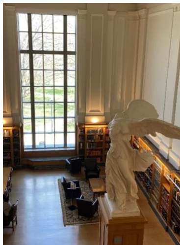
Thomson Library Ohio State University

Research software underpins the modern landscape of statistics and data analysis, yet those who develop these tools often lack formal recognition or reward in the academic system. Does the academic system need to be modified to