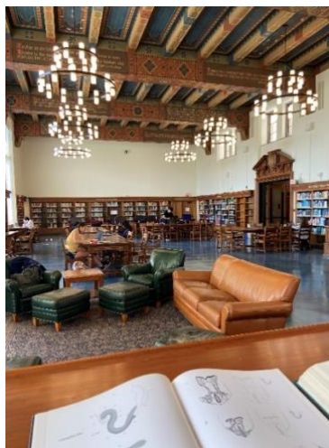
Hall of the Noble Word, University of Texas at Austin