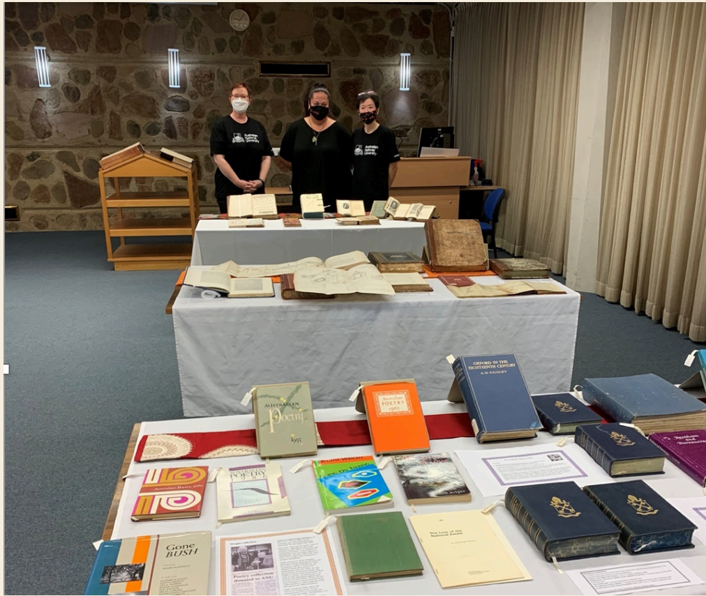
Thanks to the wonderful staff who led tours and put displays together for Alumni Week.