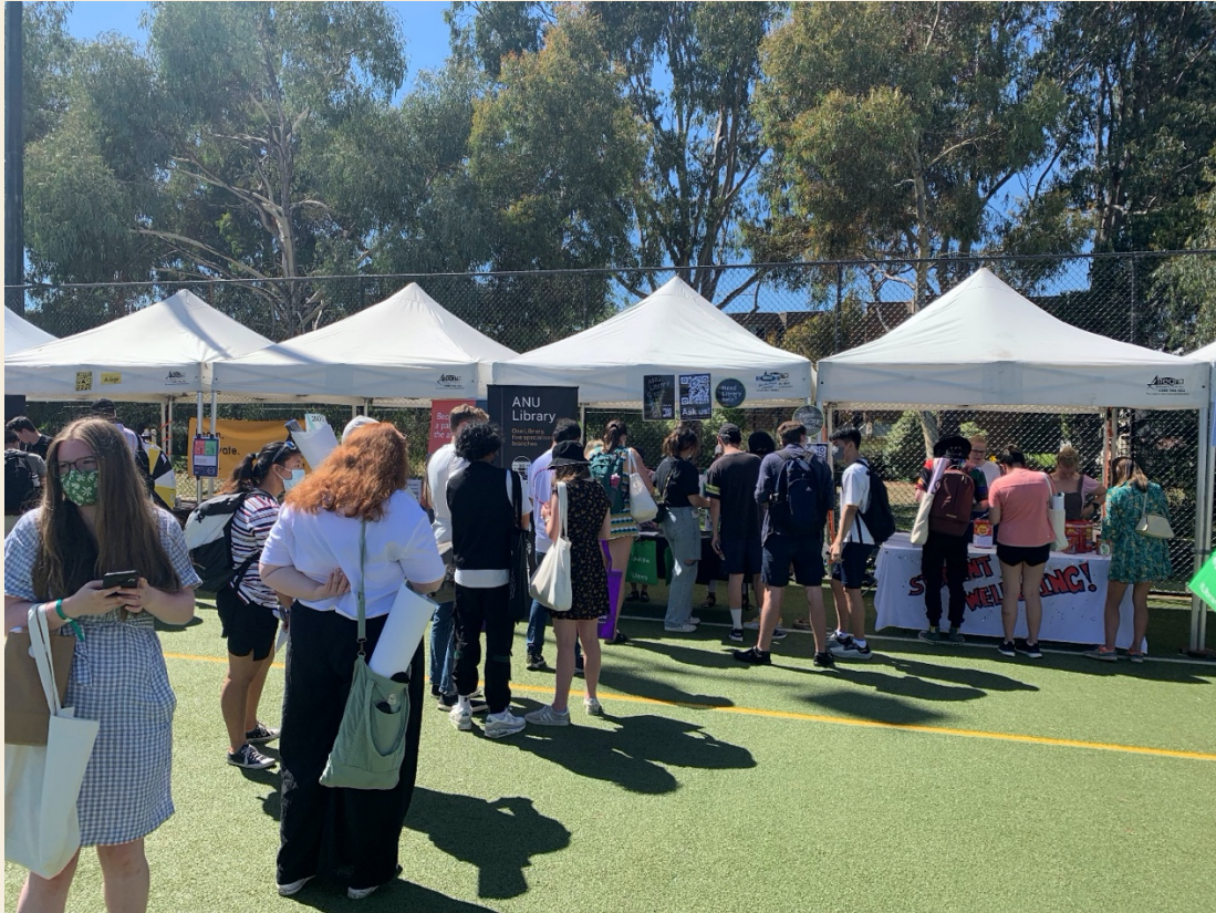
And we are back! Students lined up at the Market Day stall. Thanks to all who organised and took a shift to welcome our students.