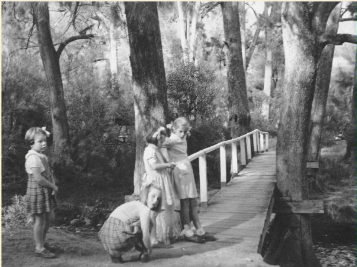
The Australian National University