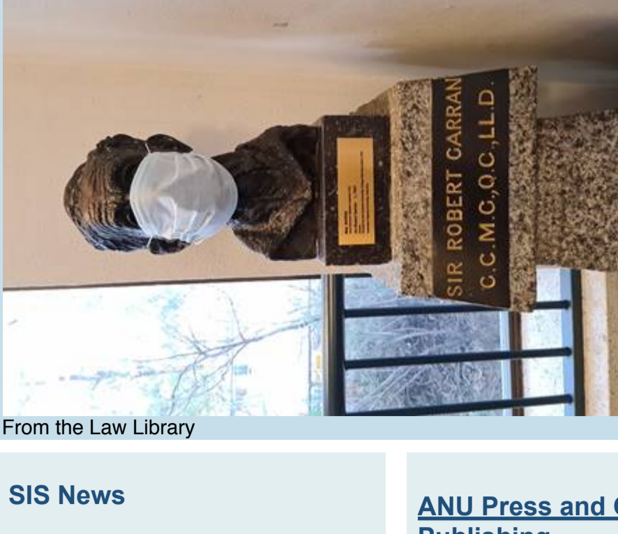
From the Law Library