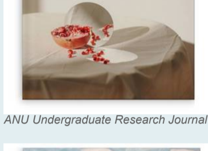
ANU Undergraduate Research Journal