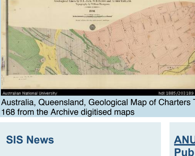
Australia, Queensland, Geological Map of Charters Towers Goldfield, Sheet 1, 1898, 1:3 168 from the Archive digitised maps