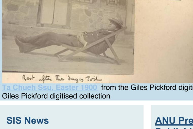
Ta Chueh Ssu, Easter 1900