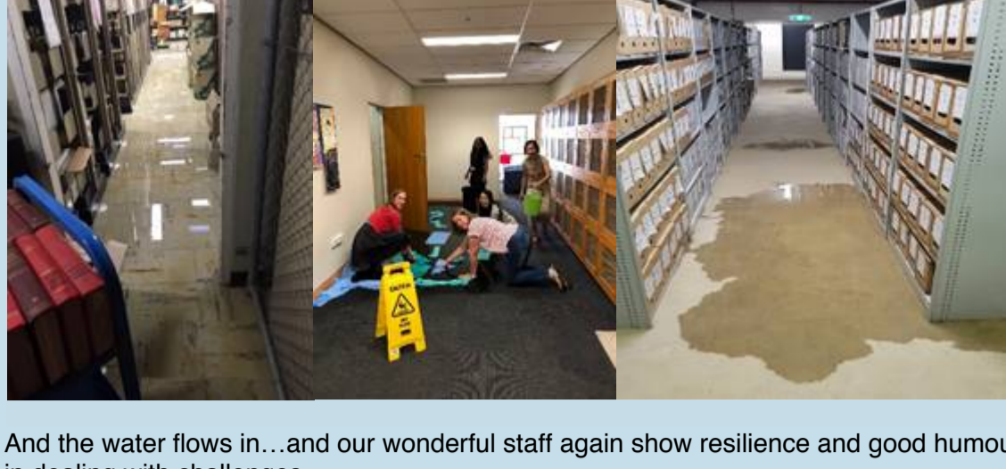
And the water flows in...and our wonderful staff again show resilience and good humour in dealing with challenges