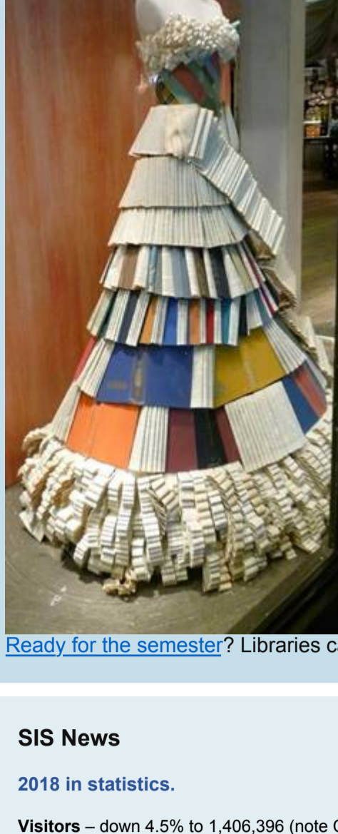
Ready for the semester? Libraries can help you dress in style