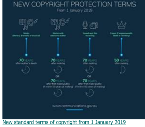
New standard terms of copyright from 1 January 2019

Copyright. A great new resource from the Department of Arts and Communication