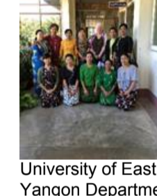
University of East Yangon Department of Library and Information Science staff